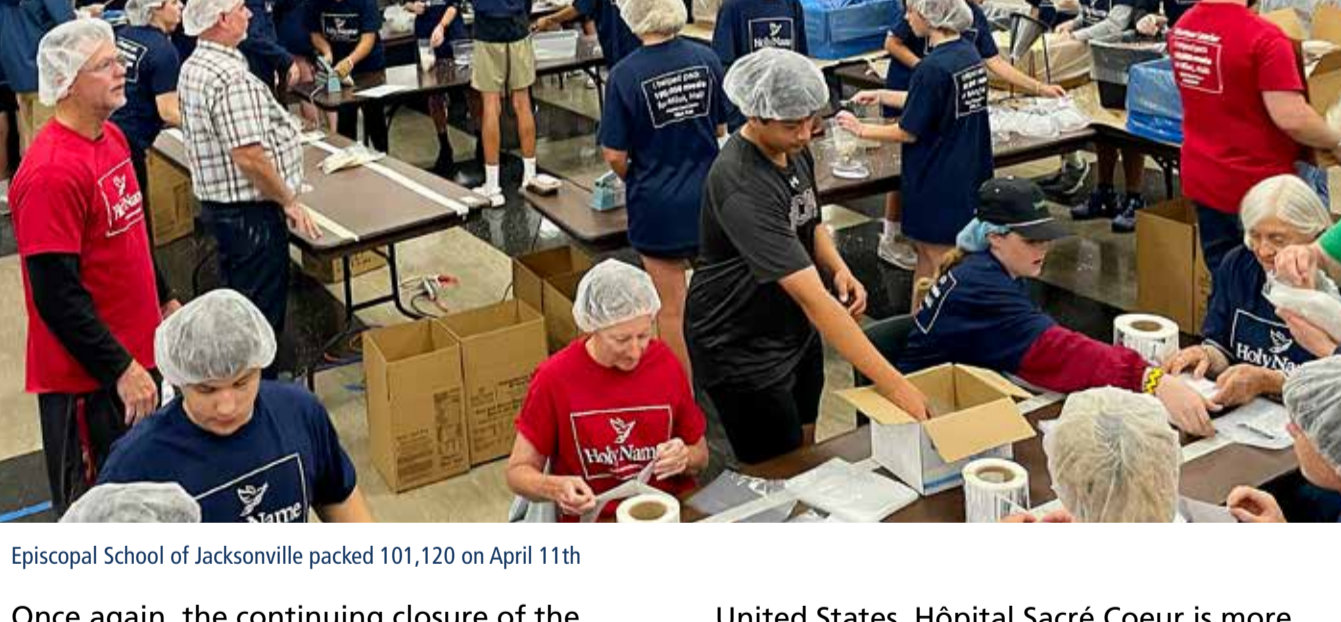
Episcopal School of Jacksonville packed 101,120 on April 11th

The Need For Food Could Not Be Greater... You Can Help.