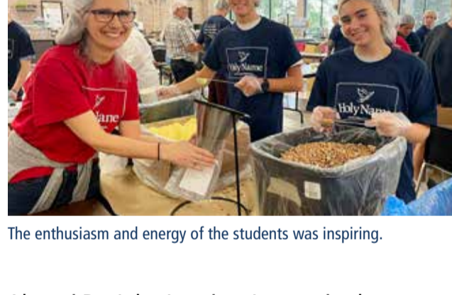
The enthusiasm and energy of the students was inspiring.

Episcopal School of Jacksonville packed 101,120 meals at its second packathon, more than double the number of meals it packed in 2023.