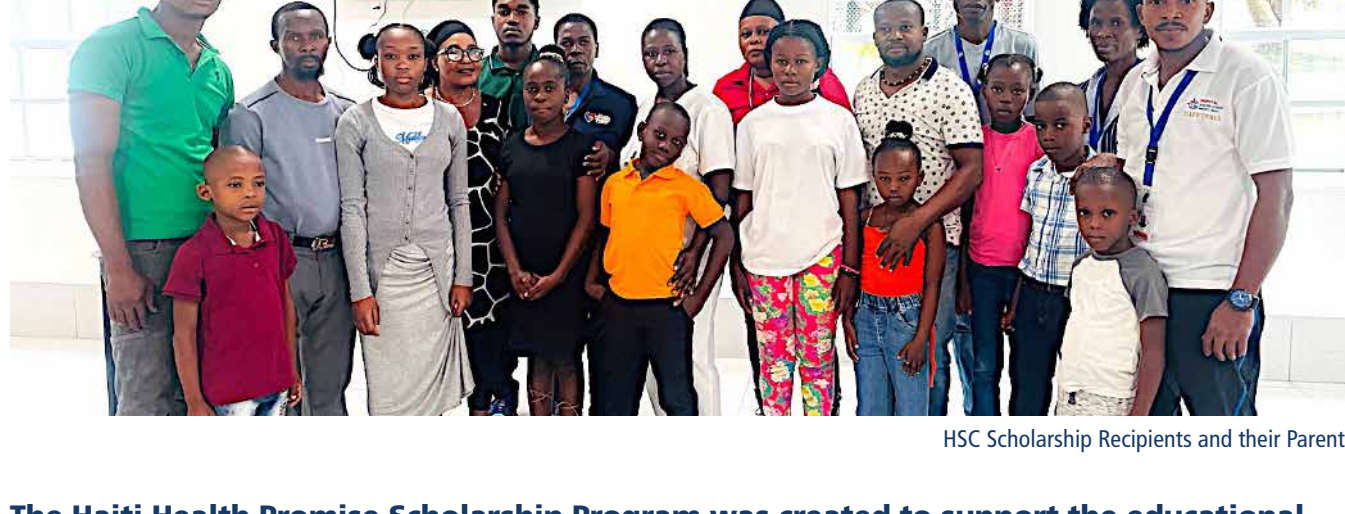
HSC Scholarship Recipients and their Parents

Thanks to Our Lady of Mercy Parish in Park Ridge, New Jersey